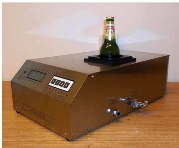
Figure 1 Colorturb device

Measurements at these three wavelengths effectively eliminate the influence of bottle colour on the results, allowing differentiation not only in colour intensity but also in colour hue of the sample. For further details, see Gabriel and Sigler (2018) and Gabriel et al. (2022a). The absorbance measurement at 466 nm is specifically designated as AbsBlue. The Colorturb device has a detection limit of 0.001 AU, with measurement repeatability exceeding 0.005 AU, as reported by Gabriel and Sigler (2018).