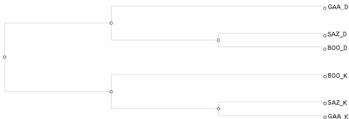
Figure 3 Results of cluster analysis of hop-derived aroma notes SAZ – Saaz; BOO – Boomerang; GAA – Gaia; K – kettle hopped beer; D – kettle + dry hopped beer

The overall hop aroma pleasantness score improved by 0.4–0.7 points after dry hopping for all beers including the control beer, and the overall impression score was more favourable except for Gaia. The evaluation of the overall impression is influenced by both the defects and the specific pleasantness of the sensory profile and is to some extent individual. The sensory evaluation has shown that the new bitter varieties can be used to produce very good quality beers, both kettle-hopped and dry-hopped.