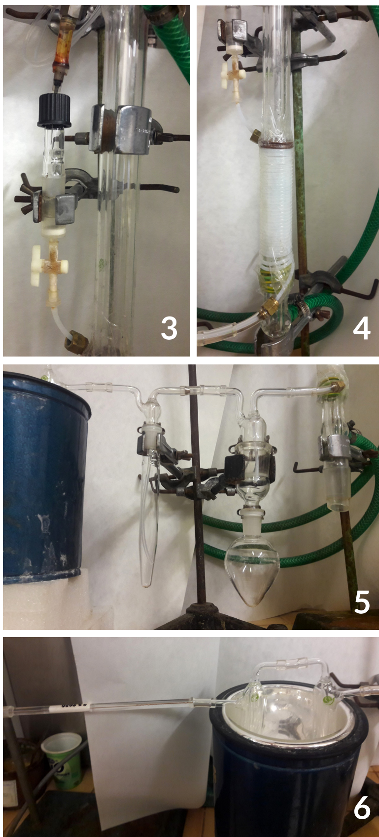
Figure 3 Photo of the injection port Figure 4 Photo of the reaction coil Figure 5 Photo of the stock flask and gas washing bottle Figure 6 Photo of the condense traps and capillary restriction

A beer sample was prepared for analysis by the following procedure. Five millilitres of a beer sample were mixed with 1 ml of ammonium sulfamate (0.2 mol/l) in 0.2 mol/l sulphuric acid and left to react for 15 minutes. Meanwhile, an SPE column (Bond Elux SAX, 500 mg) was conditioned by 3 ml of methanol and 3 ml of hydrochloric acid solution (0.01 mol/l). Then, the