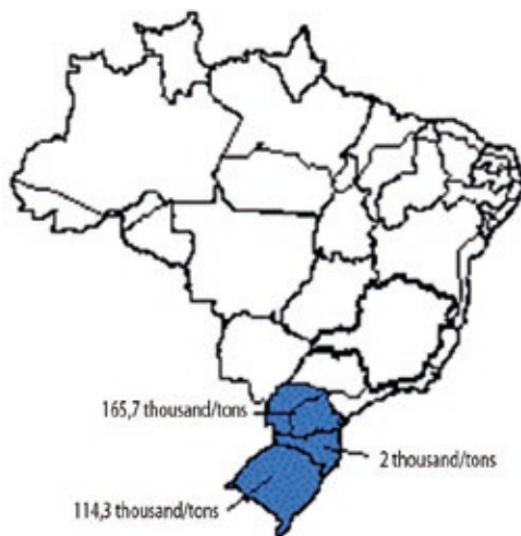
Fig. 2 Barley production in Brazil in 2017

Barley ( Hordeum vulgare L sp. vulgare ) is considered one of the most important cereals in the world context. It is a winter crop that ranks fifth in order of economic importance in the world. In Brazil, barley production is concentrated to the south due to the propitious climate of the region, with the state of Parana as the main producer (165,7 thousand/tons), followed by Rio Grande do Sul (114,3 thousand/tons) and Santa Catarina (2 thousand/tons) (Fig. 2) (CONAB: Companhia de Abastecimento, 2017).