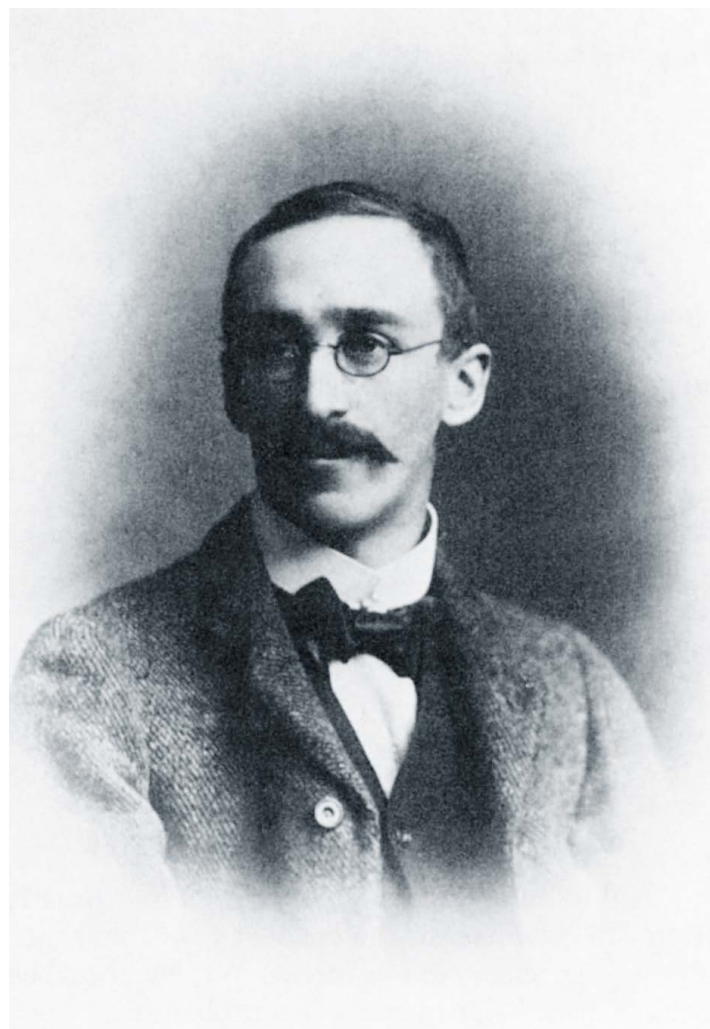
Figure 1 W. S. Gosset, 1899.

In July 1905, during a vacation in England, Gosset was invited to the summer residence of Karl Pearson, already established statistics. They had a long discussion that Gosset considered very useful; later he stated that Pearson "was able in about half an hour to put me in the way of learning the practice of nearly all the methods then in use".